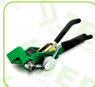
RATCHET TOOL MBT-004