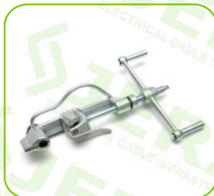
WHEEL TOOL MBT-003