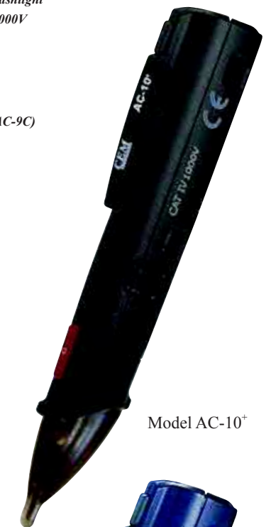
Model AC-10 +

EMC & LVD EN: 61326 EN: 61010-1, EN: 61010-02-031