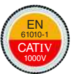
Model AC-10 +