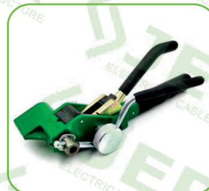
RATCHET TOOL MBT-004