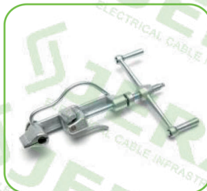
WHEEL TOOL MBT-003